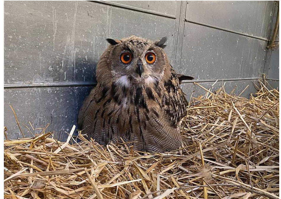
One of the young Eagle Owls cared for and released by LIPU in Tuscany and, below, a typical natural nest for Bonelli's Eagle. see p 26.